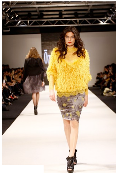
Özgür Masur autumn/winter 2011-12