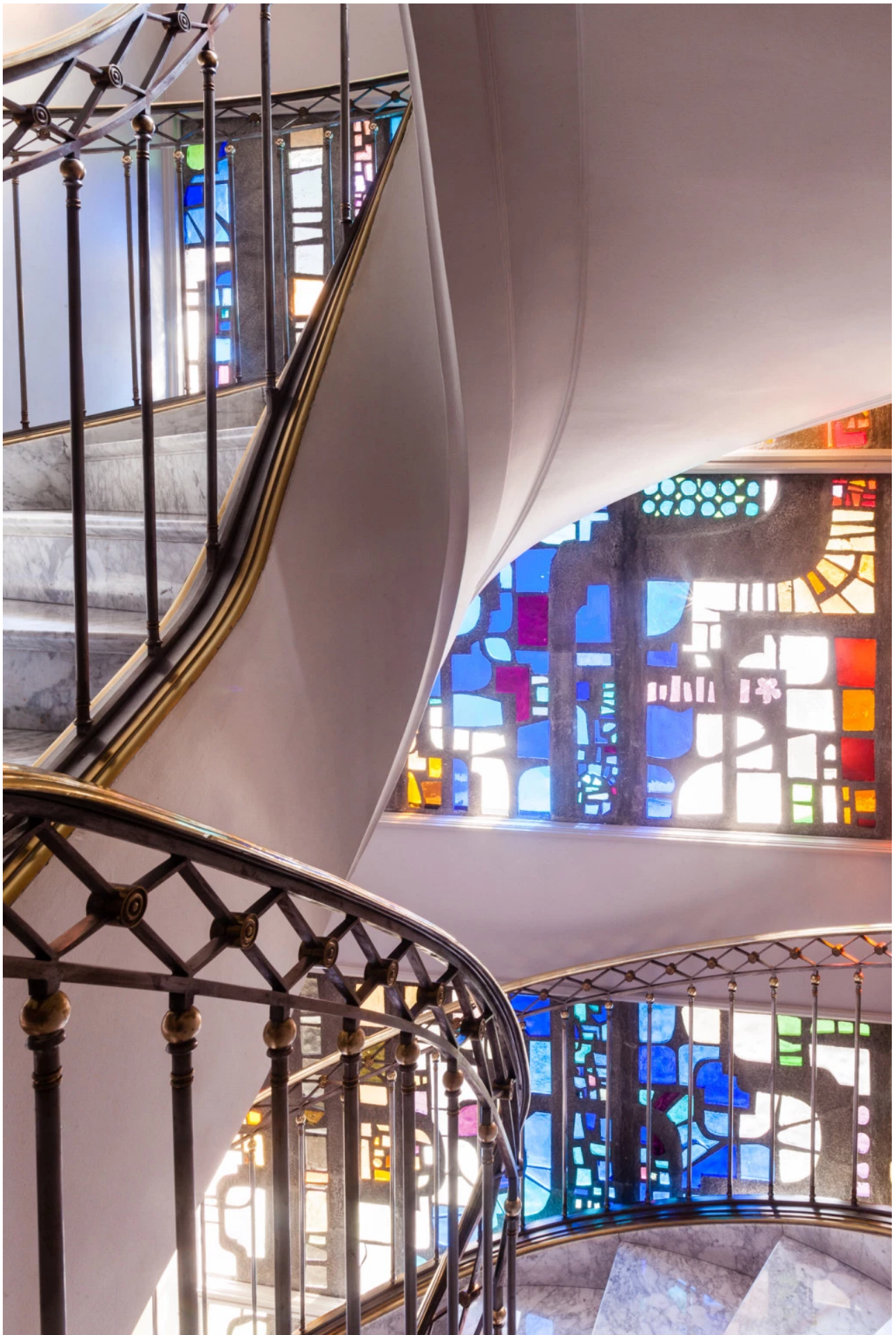
The hotel's original staircase, which is lined with stained-glass windows